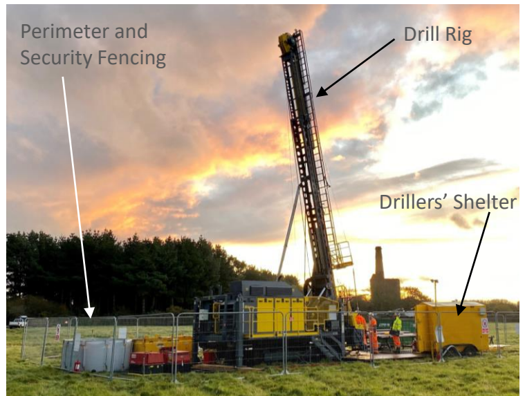
A photo of our 2019 United Downs Drilling Site

We will be drilling at a sites near Twelveheads, around the Cross Lanes Farm area.